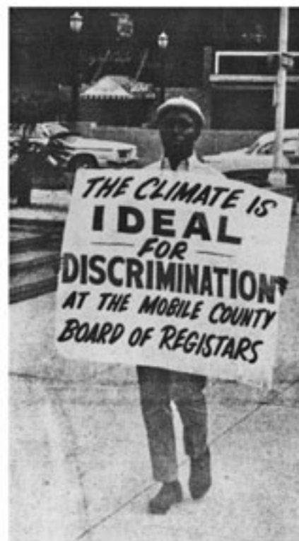
PROTESTING IN MOBILE