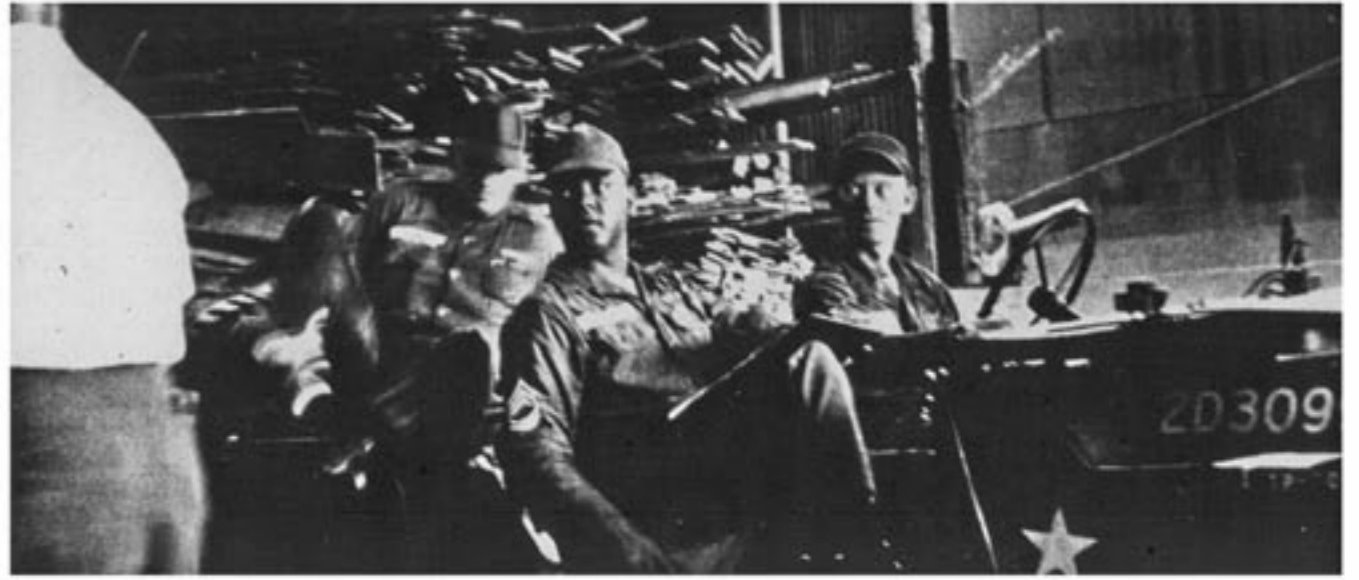
MOBILE--Huge quantities of military equipment are now being loaded on war ships and commercial transports docked in Mobile Bay. Troops may start boarding soon. Some transports have already sailed, probably for South Vietnam, where the war against the Vietcong guerillas has entered a new stage.