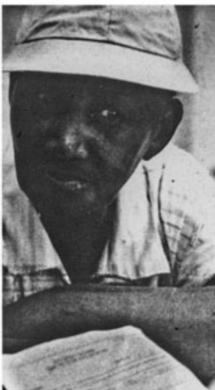
REGISTERING IN GREENSBORO