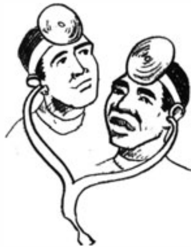
... IS CHANGING TO THIS