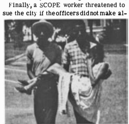
A new Demopolis ordinance and a county injunction have completely erased the constitutional rights of free speech and peaceful assembly, citizens. Effects of these include:

During the march, two girls were overcome with illness. The "special" policemen on duty refused to let the line slow down or stop so that the girls could rest. Finally, a SCOPE worker threatened to sue the city if the officers did not make allowance for the condition of one of the girls. An ambulance was called from Demopolis, 16 miles away.