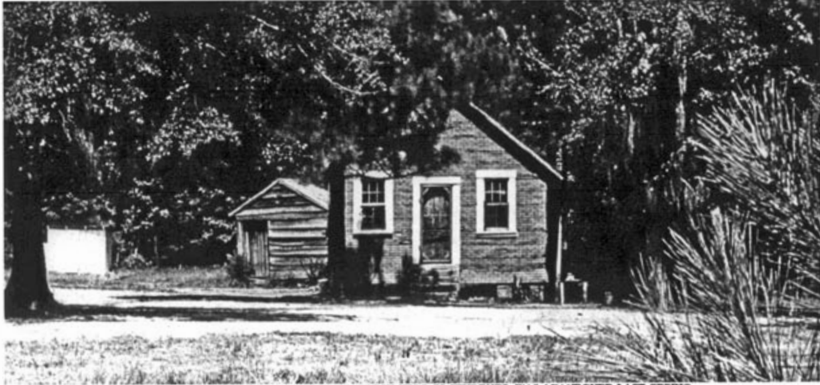
THIS ONE-ROOM NEGRO SCHOOLHOUSE, WHICH HELD 52 STUDENTS, WAS ABANDONED LAST SPRING